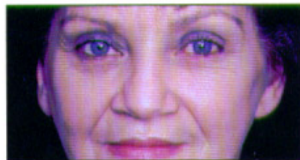
Postoperative browlift and eyelid surgery.

Here is another example. This woman was concerned about the uneven appearance of her eyelids and the excess skin in her upper and lower eyelids. A combination of a browlift and upper and lower eyelids surgery was designed to meet these goals.