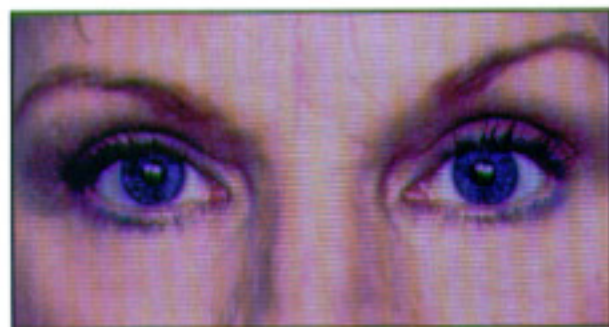
Postoperative eyelid surgery and chemical peel.

In this first case, the patient came to my office interested in laser surgery. She felt the reason she looked tired and older than she felt was due to the crepe-paper appearance of the skin of her lower lids, which appeared even more pronounced when makeup was applied. After spending a relaxed consultation